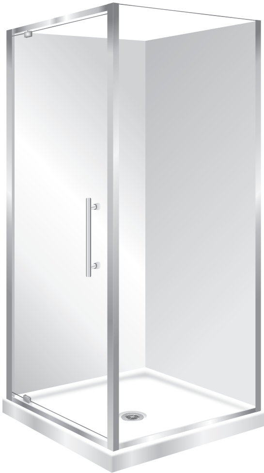
Pictured - RETRO 900 X 900 mm Pivot Door SILVA