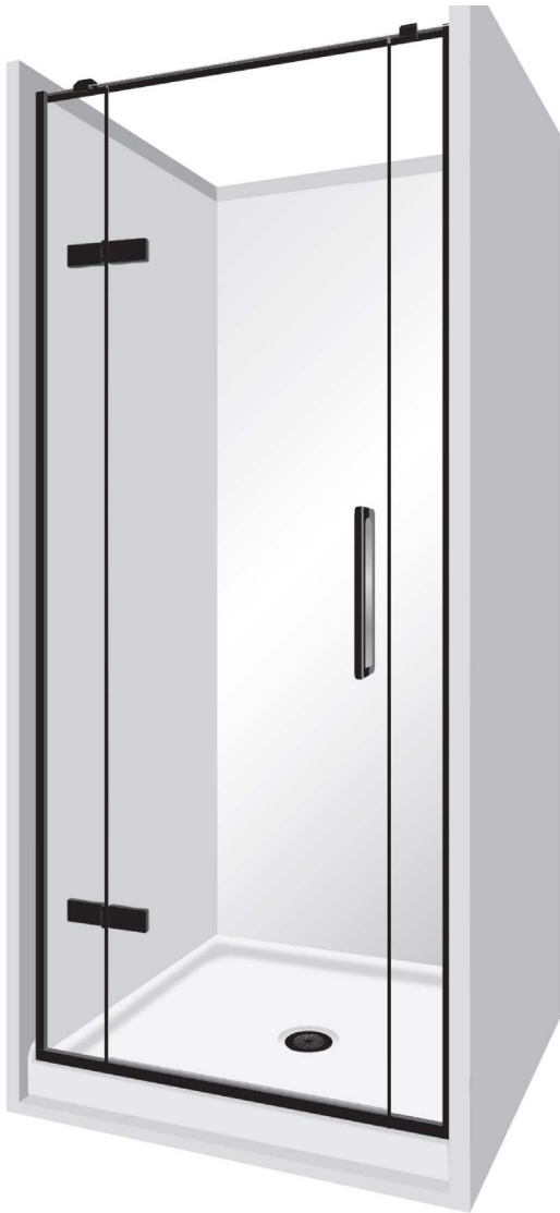
Pictured - 900 x 900 x 900 Alcove Black