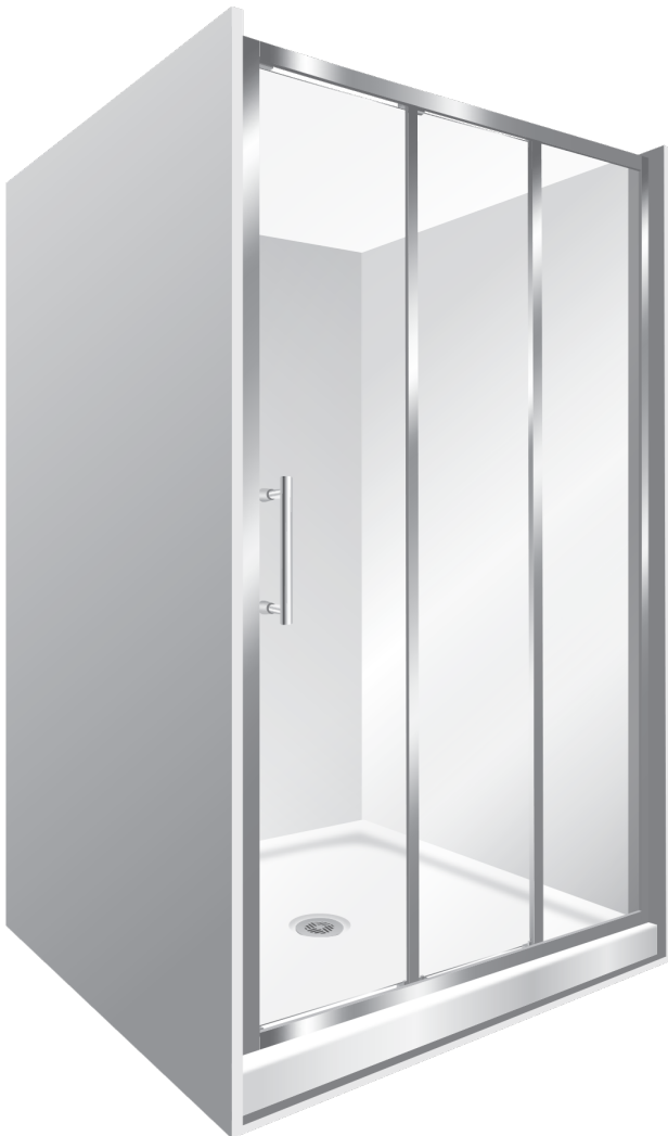
Pictured above - Retro 900 X 1200 X 900 alcove 3 panel stacker flat wall silva