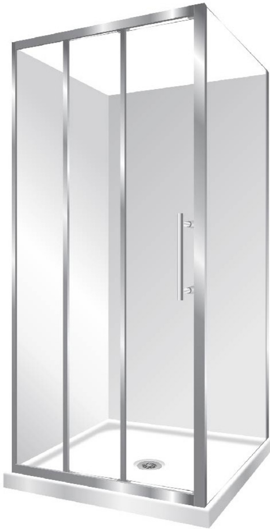
Pictured Above - Orion Square 1000x1000 3 Panel Stacker Door Silva Flat Wall