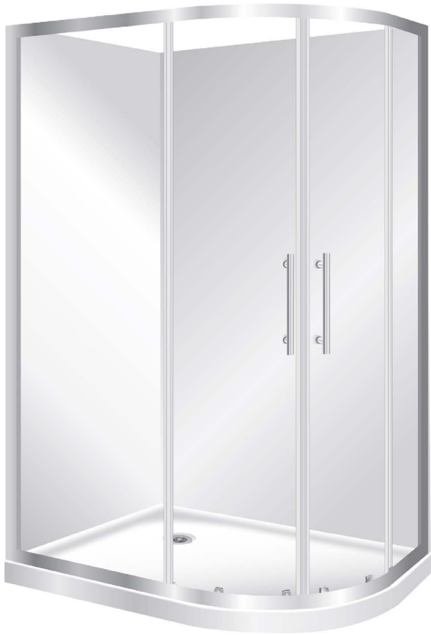
Pictured above - Round 1200 x 800 LH silva flat wall SKU 293708