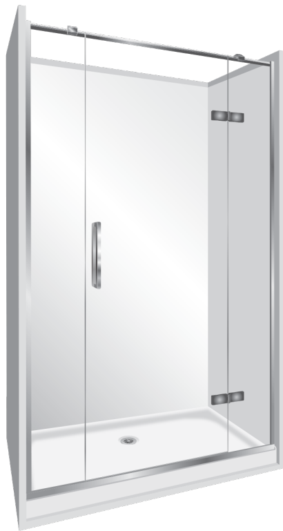
Pictured - 1000 x 1200 x 1000 FW Silva