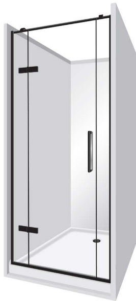
Pictured - 1200 x 900 x 1200 Black FW