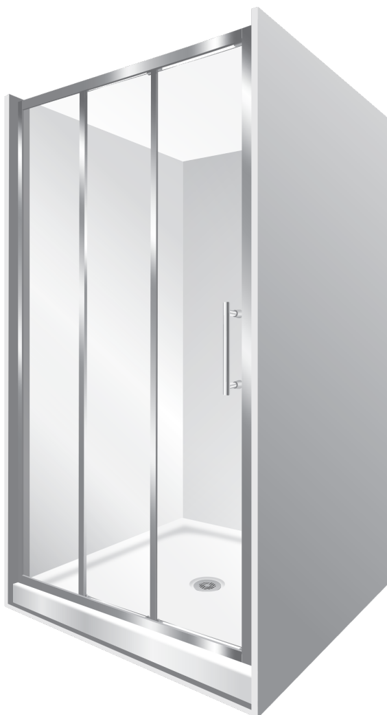
Pictured above - Retro 900 x 900 3 sided alcove flat wall silva SKU RA900SIFWS18