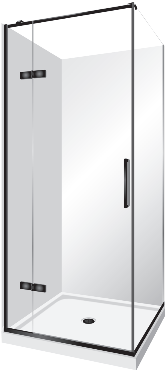
Pictured - 900 x 900 Flat Wall Black