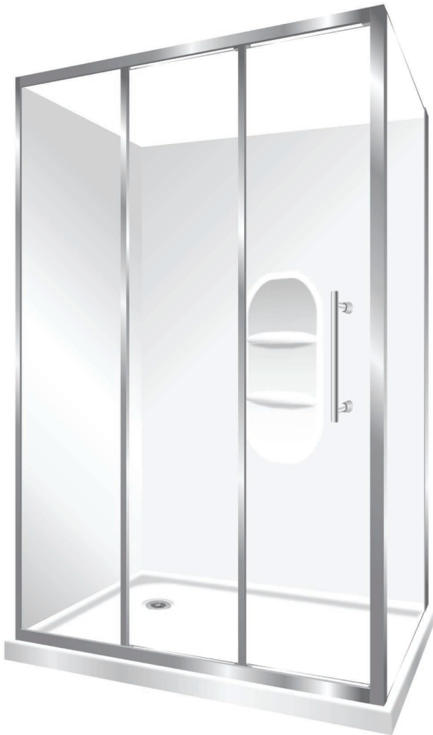
Pictured above - Capricorn 1200x900 3 panel stacker door LH tray orientation, silva, moulded wall