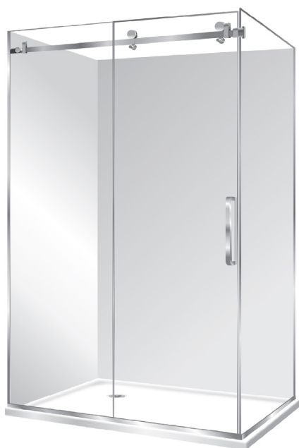
Pictured Above - Stellar Luxury 12x1 LH Silva Door Flat Wall SKU 242920