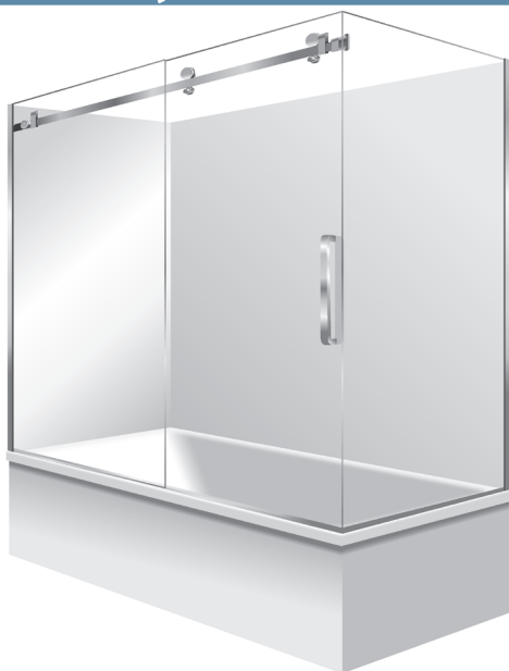
Pictured - Luxury Bath Set LH Silva 1675mm