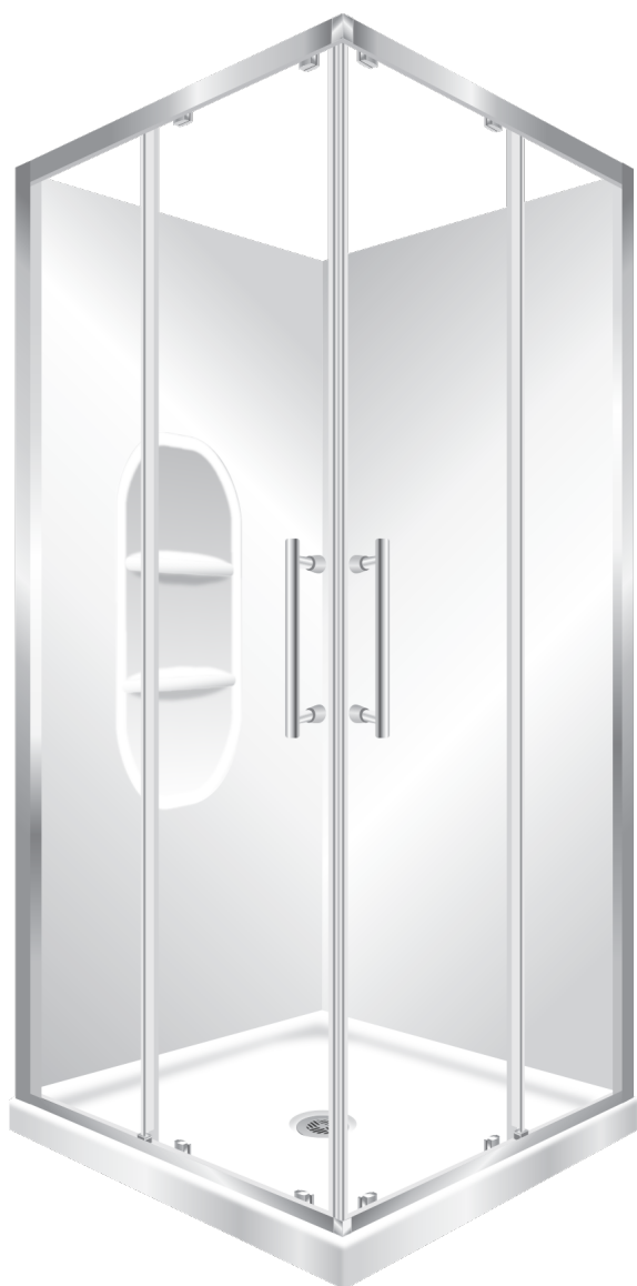
Pictured above - Stellar Twin 90 Square 9x9 Silva Door Moulded Wall SKU - 326901